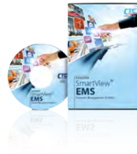
SmartView™ EMS Element Management System

• The specification and pictures are subject to change without notice.