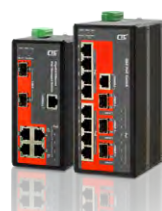
Industrial PoE Managed Switch IFS-402GSM-4PH24 & IFS-803GSM-8PH24

• The specification and pictures are subject to change without notice.