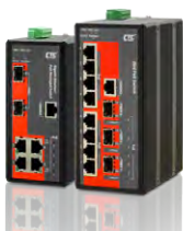
Industrial Gigabit PoE Managed Switch IGS-402SM-4PH24 & IGS-803SM-8PH24