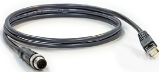
For GbE UTP (A-code model)

M12 A-code Male (8-Pin) to RJ-45, AWG 24 ,IP67, 1 meter