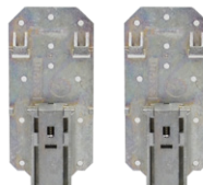
(130 X52mm / 4 Screws) (2pcs/set)