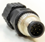
For GbE UTP (A-code model)

M12 A-code Female (5-Pin) connector, IP67