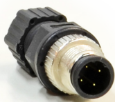
For FE UTP