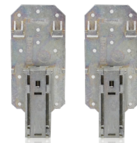
(130 X52mm / 4 Screws) (2pcs/set)