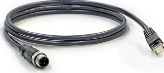
For FE UTP

M12 D-code Male (4-Pin) to RJ-45, AWG 24 ,IP67, 1 meter