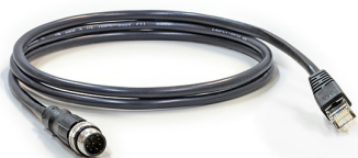
For GbE UTP (X-code)

M12 X-code Male (8-Pin) to RJ-45, AWG 24 ,IP67, 1 meter