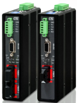
Serial to Fiber Converters IFC-FDC & IFC-Serial