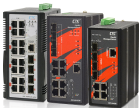
Industrial GbE Managed Switches IGS-1604XSM & IGS-804SM & IGS+404SM