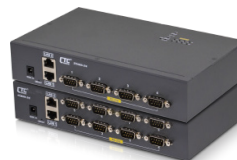
Serial Device Servers STE400A-232 & STE800A-232

• The specification and pictures are subject to change without notice.