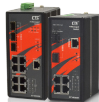
Industrial FE Managed Switches IFS+803GSM & IFS+402GSM