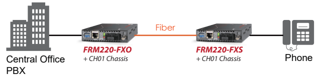
Figure 2 : Voice Transmission from 2km to 120km over fiber