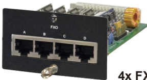
4x FXO I/F