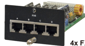
4x FXS I/F