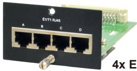
4x E1/T1 RJ45 I/F