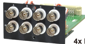
4x E1 BNC I/F