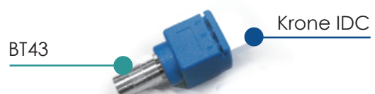
BLN-5010 : BT43 to Krone IDC