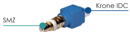
BLN-6010 : SMZ to Krone IDC