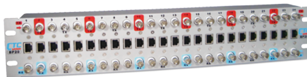
24-Port G703 patch panel